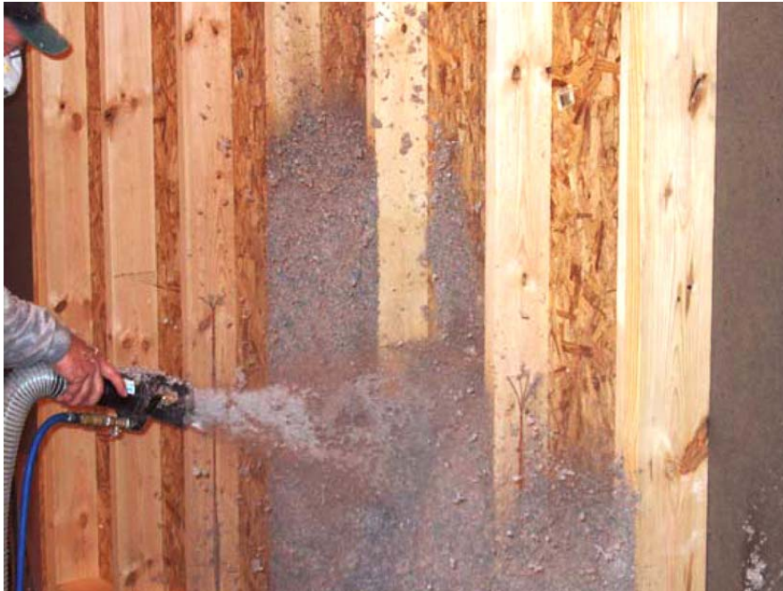
PCM-enhanced insulation during installation in 2x6 wood frame wall.

AFT is proud to be a first insulation company offering a new generation of dynamic insulations. This material was developed during a joint project with DOE's Oak Ridge National Laboratory (ORNL). It is a 20% blend of microencapsulated Phase Change Material (PCM) and cellulose insulation. As shown below, it doesn't require any additional equipment to install.