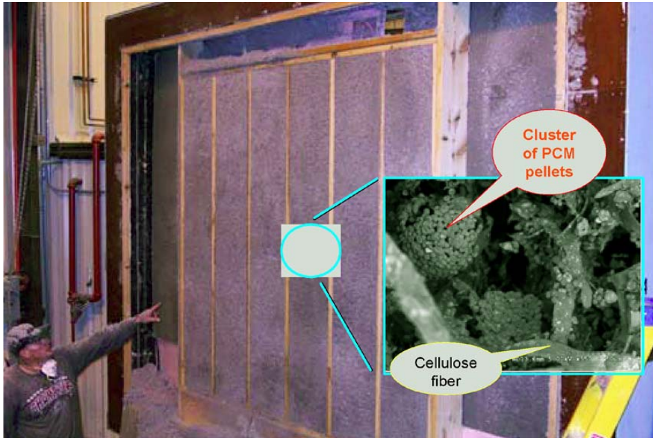
Test wall with PCM-enhanced cellulose.

Check out the following link: http://www.ornl.gov/sci/roofs+walls/AWT/ComputerSimulations/index.htm