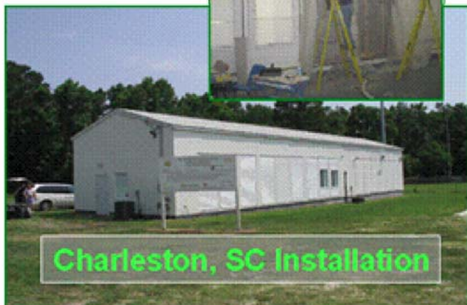
Charleston, SC Installation